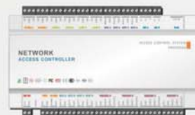
4 door controller (485 or TCP/IP)