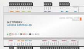
Two door controller (485 or TCP/IP)