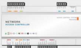
One door controller (485 or TCP/IP)