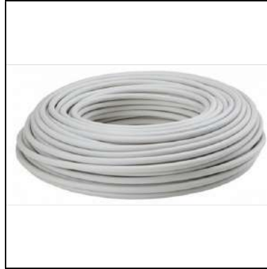
SILIKONSKI KABL ZA PETLJE 1 x 1.5mm 2 ; Polaže se u prosečen asfalt (beton).