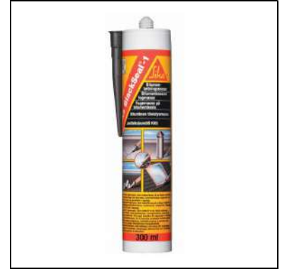
BLACK SEAL MASA ZA ZAPTIVANJE ASFALTA Nakon polaganja kablova u isti