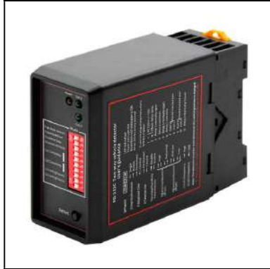
PAD-232 (2Ch) DETEKTOR (KONTROLER) 2Ch ZA INDUKTIVNE PETLJE

DETEKTOR (KONTROLER) 2Ch ZA INDUKTIVNE PETLJE I OSTALO POTREBNO